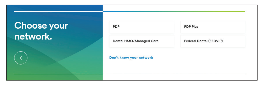
*Select PDP Plus Network

Enter your Zip, City or State and select the "Find a Dentist" button. You will then be prompted to select your plan from the list. The plan name is located in your Schedule of Benefits.